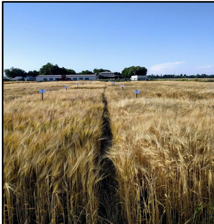
Above: Malting barley variety trials at UC Davis

Growing a new crop can be a challenge. Feel free to reach out to your local UCCE Agronomy Advisor with questions or concerns.