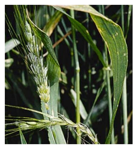
Figure 31. Freezing injury to wheat spike.