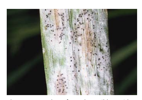
Figure 27. Patches of powdery mildew with cleistothecia.