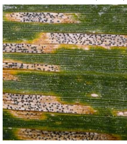
Figure 17. Septoria tritici blotch lesions.