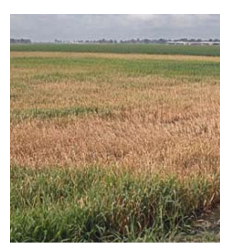
Figure 28. Plants dying due to lagoon water.