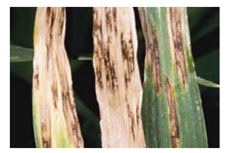
Figure 18. Barley net blotch lesions.