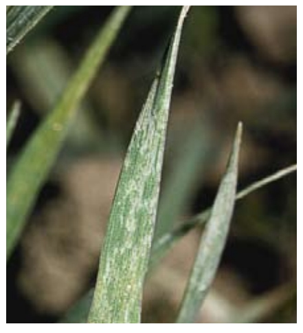
Figure 14. Silvering of leaves due to mite feeding.