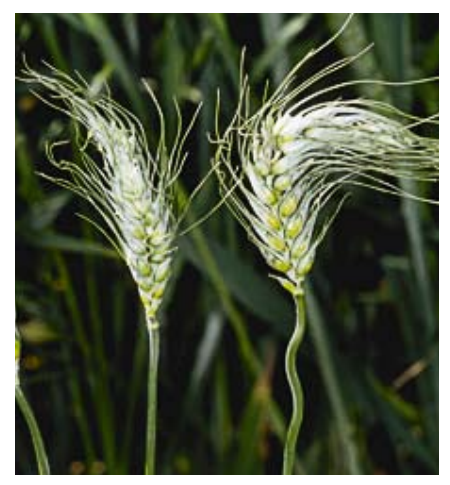
Figure 34. Distorted spikes from phenoxy herbicide injury.