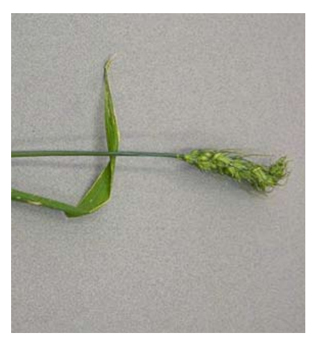
Figure 35. Distorted spike and kinked leaf from phenoxy herbicide injury.