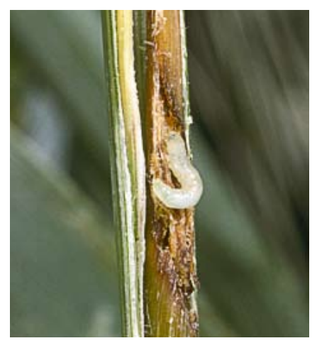
Figure 41. Wheat stem maggot inside stem.