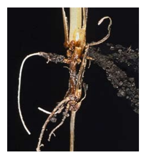
Figure 39. Browning of wheat crown and roots.