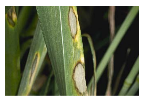
Figure 19. Early symptoms of leaf scald of barley.