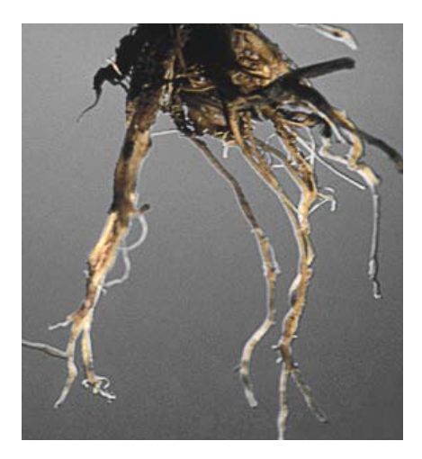
Figure 38. Root rot of wheat.