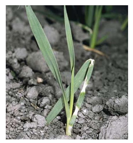
Figure 2. Leaf banding from frost damage.