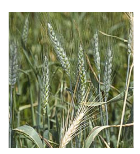
Figure 37. White heads caused by common root rot.