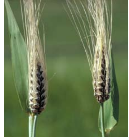
Figure 43. Covered smut of barley.