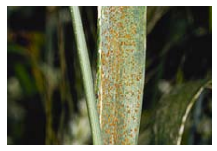
Figure 21. Wheat leaf rust pustules.