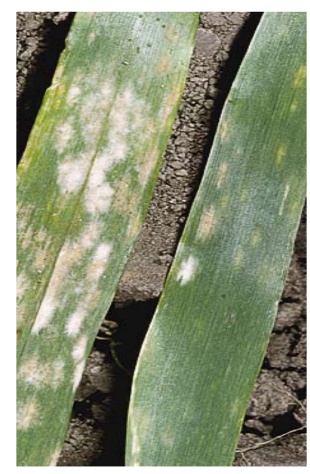
Figure 26. Patches of powdery mildew.