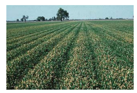
Figure 3. Leaf burn from herbicide injury.