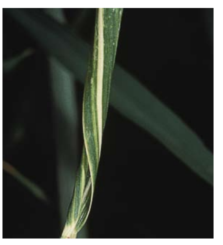
Figure 15 . Leaf curling and streaking from Russian wheat aphid.