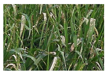
Figure 6. Shark herbicide injury.