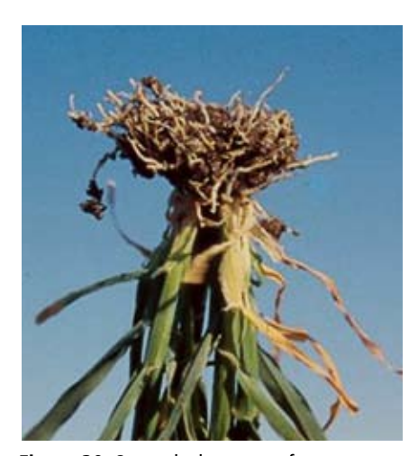
Figure 30. Stunted wheat roots from compacted soil.