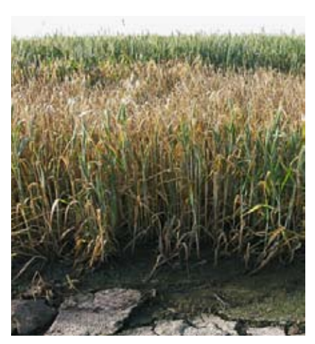
Figure 29. Plant death due to waterlogged soil.