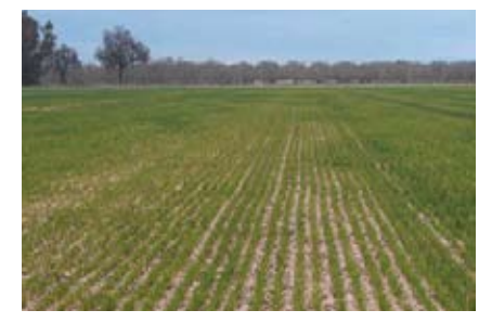
Figure 7. Nitrogen deficiency from denitrification.