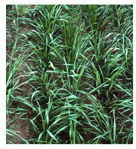
Figure 33. Prostrate growth from Dicamba herbicide injury.