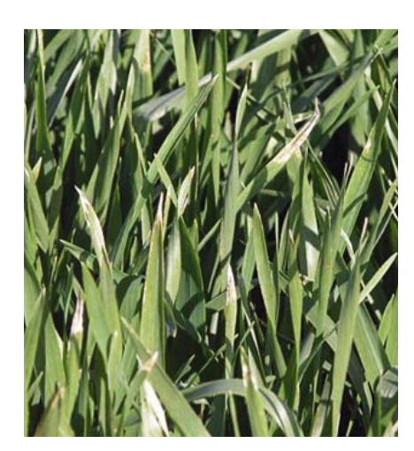
Figure 4. Leaf tip burn from salinity.