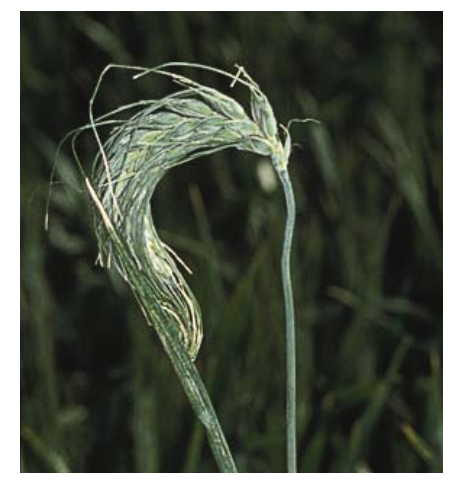
Figure 16. "Hooked spike" from Russian wheat aphid.