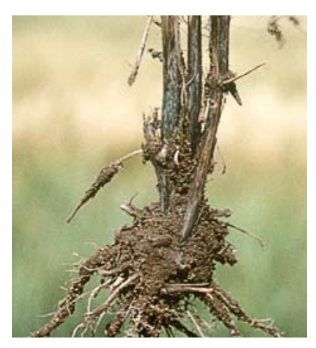
Figure 40. Blackening of stems caused by take-all.