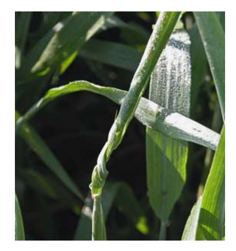
Figure 36. Leaf twisting from phenoxy herbicide injury.