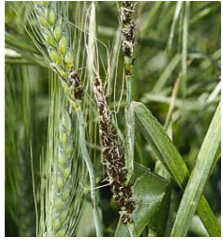
Figure 42. Loose smut of wheat, spike infection.