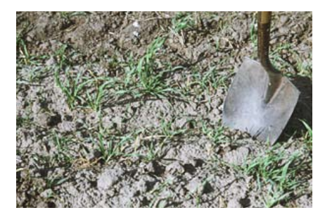
Figure 1. Wireworm damage to barley field.