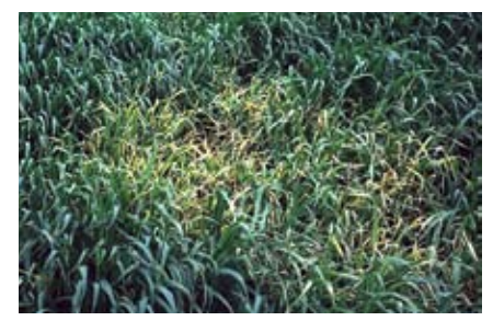
Figure 12. Barley yellow dwarf virus infected area.