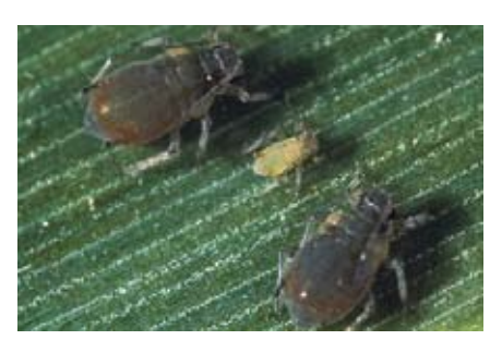
Figure 13. Oat bird cherry aphid.