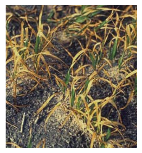
Figure 32. Frost injury to barley seedlings.